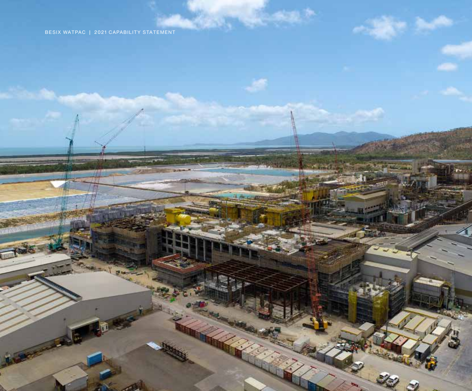
• Sun Metals Refinery Expansion Townsville, QLD