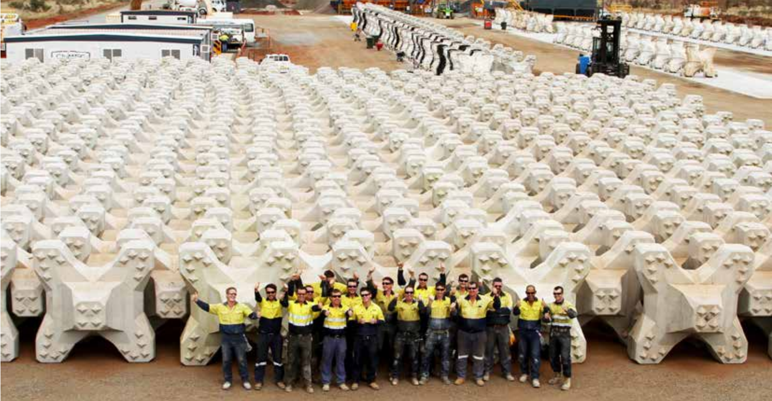
^ Wheatstone LNG Project