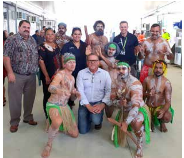
^ Meet the contractor barbecue