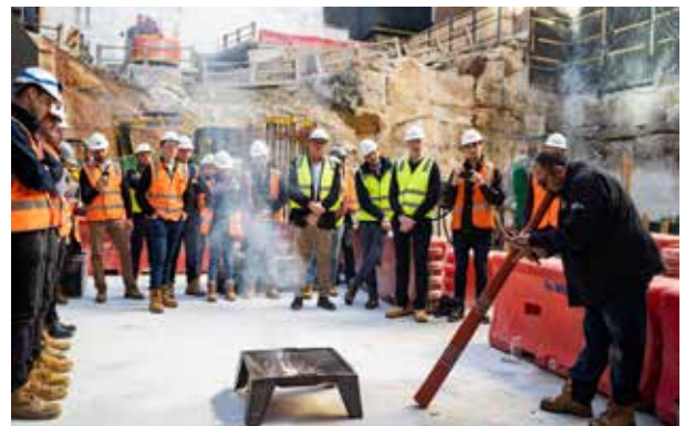
^ Indigenous smoking ceremony at a BESIX Watpac project site - held within a designated safety exclusion zone with all works ceased.

Engaging early with local industry, we evaluate supply chain capability, training and skills development opportunities - delivering long-term economic and social benefits to the community.